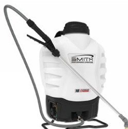
Heavy-Duty Backpack Sprayer S3E-V