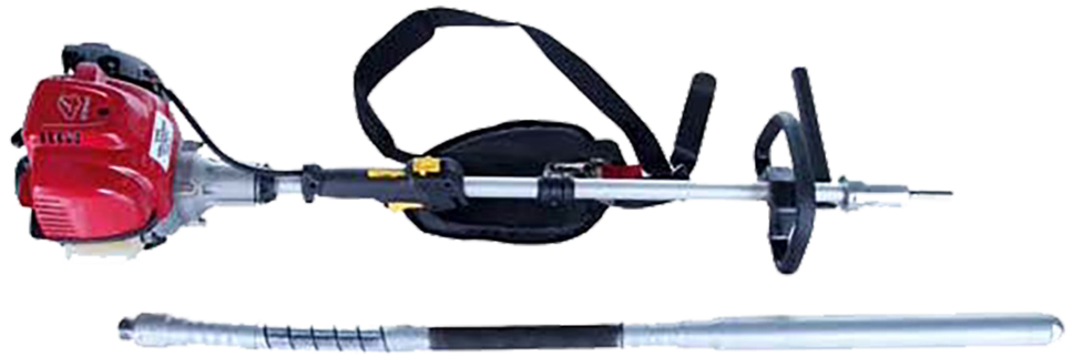
HOPPT® Hand-Held Portable Concrete Vibrator with Padded Shoulder-Harness