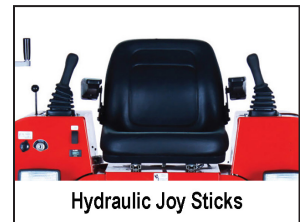
Hydraulic Joy Sticks

Heavy-Duty Hydraulic Motors and Rotors to Withstand the Weight for More Control and Power Mechanism for Easy Reach